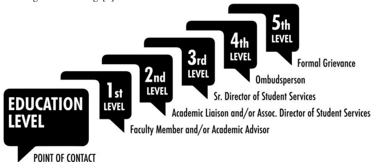
Fig.1 Correct mode of red cultural education

For different types of colleges and universities, there are certain differences in terms of school orientation and talent training programs. Therefore, there are differences in the school-running thinking and school-running characteristics. The campus culture needs of different universities are also different. At the same time, colleges and universities did not carry out some cultural activities with artistic, ideological and high-level elegance, and did not reflect their own cultural characteristics, so they could not achieve the purpose of inheriting the fine cultural traditions of colleges and universities. For the majority of young students, because the school's campus cultural activities lack creativity, the content is boring, can not fully mobilize the enthusiasm and creativity of learning, so that teachers and students lack good and effective communication and communication. Lack of exercise in actual campus cultural activities, can not dig deep into the free nature of students' independent thinking, students can not improve their cultural literacy without accumulating rich knowledge[2]. The correct mode of red cultural education is as follows.