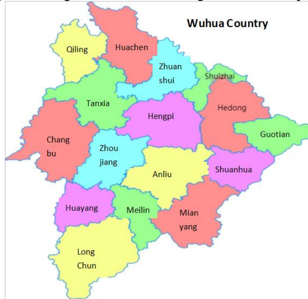
Figure 1: The map of Wuhua County

County, northwest and Heyuan City Longchuan connected, northeast and Meizhou City Xingning adjacent. Wuhua County is high in the southwest and low in the northeast, with a total area of 3,226.06 square kilometers, accounting for 1.47% of the area of Guangdong Province. It is rich in natural resources and a good ecological environment. Figure 1 is the map of Wuhua County: