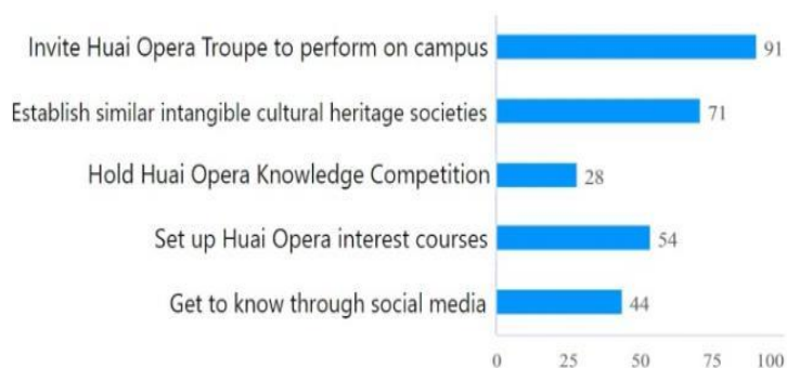
Figure 1: How Huai Opera enters the campus

A total of 106 questionnaires were distributed by the team members, 97 valid questionnaires were recovered, and 97 questionnaires were statistically analyzed.