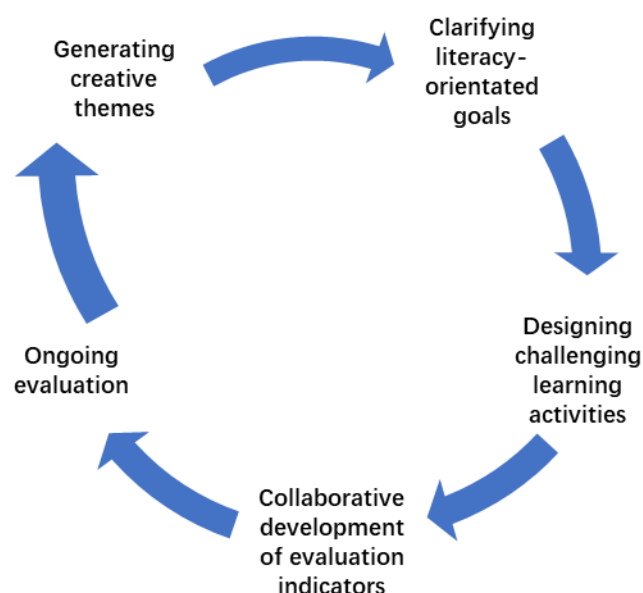
Figure 3: Interdisciplinary thematic learning design

Based on the above discussion, we advocate a comprehensive design of interdisciplinary theme-based learning from a systemic perspective. Therefore, this paper is based on the theory of cultural-historical activities and combines the characteristics of interdisciplinary theme-based learning with a comprehensive design of teaching activities (see Fig. 3 for details).