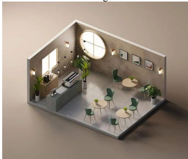
Figure 1: AI enabling lower interior design scheme

The interior design industry is facing unprecedented challenges and opportunities in the background of globalization and technological innovation. As diversified and personalized consumer needs become increasingly apparent, designers should not only create beautiful and practical space, but also consider environmental sustainability, technology integration and cultural diversity, which drive designers to have a broader knowledge system and more advanced skills. [1] With the progress of digital technology, such as 3 d printing and virtual reality is redefine the design and display, for the designer provides the creative and experimental ideas of new platform, the development of these technologies has brought the pressure on the competition, designers and design companies need to constantly learn and adapt to the new technology in order to remain competitive. The fluctuation of the global economy and the uncertainty of the market also bring certain economic pressure to the interior design industry, requiring designers to pay attention to cost effectiveness and market demand while maintaining creativity and innovation. The future of the interior design industry will be an era of technology-driven and creative integration, with both opportunities and challenges, and designers and design educators need to adjust their strategies to meet the changing market demands. As shown in Figure 1.