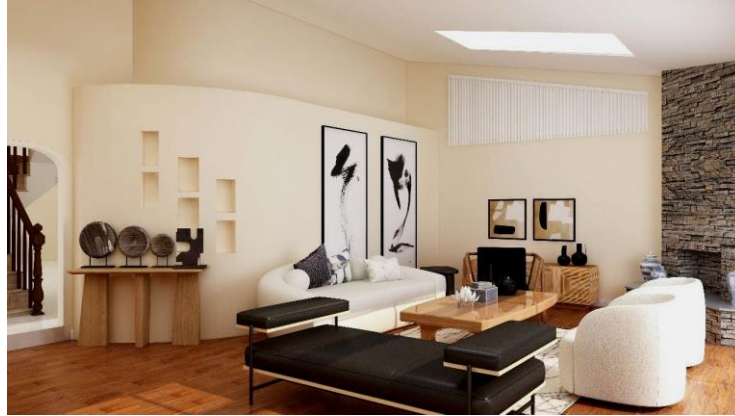
Figure 2: The interior design scheme by AI

introduction of AI technology has brought tremendous changes to interior design education, not only improving the efficiency and quality of teaching, but also providing more opportunities for students to practice and explore. As shown in Figure 2.