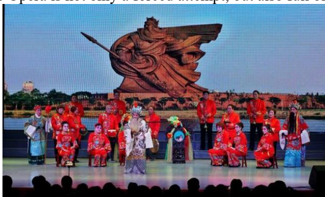
Figure 4: A still photo of the Jinghe Opera performance

With The Jinghe Opera, "The Great Return to Jingzhou" [3] The sixth "Ganlu Temple" is, for