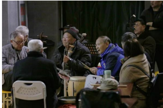
Figure 2: Traditional accompaniment team of Jinghe Opera