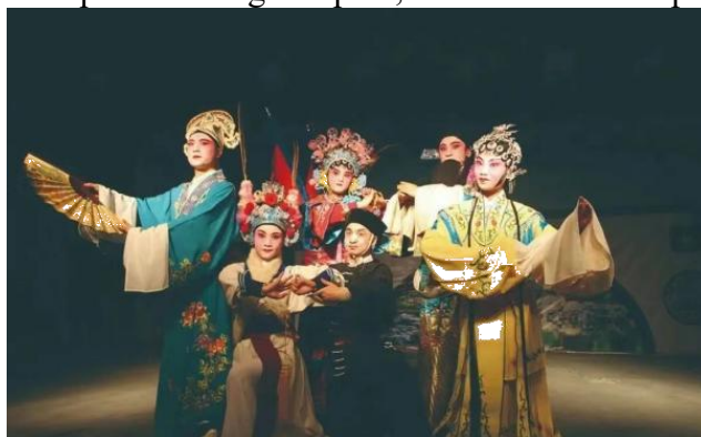
Figure 1: A still photo of the Jinghe Opera performance

Jinghe Opera is famous for its unique performance style and performance content (see Figure 1). From the performance content, Jinghe opera has its unique local characteristics of the "sweep", a exorcism disaster short ceremony, multi-purpose rooster sacrifice to achieve the purpose of blessing and evil spirit, in many "grass platform team" and local funeral etiquette also often appear. The performance characteristics of Jinghe Opera emphasize the skills of "eight inside" and "eight outside": "eight inside" emphasize the need to study hard in order to accurately show the emotional changes of the characters. The "outer Eight pieces" emphasize the need to constantly train all aspects of the body, including head, eyes, face, mouth, chest, back, hands and legs. The performance skills of Jinghe Opera are very exquisite, with special emphasis on the use of 'shaking color' and the use of eye skills, and the recitation of Jingsha dialect makes the performance of Jinghe Opera more challenging. Actors need to integrate these skills into the performance, so as to show the emotion of the role in a more vivid, vivid, accurate and profound way, so as to show the unique regional cultural atmosphere of Jinghe Opera, and become an important part of Hubei opera.