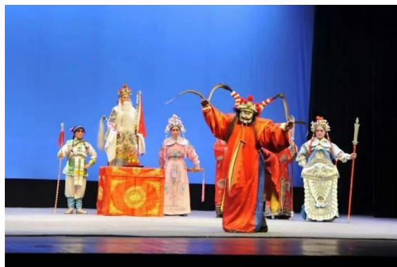
Figure 5: Face performance techniques

Because the local opera has always adhered to the traditional mentoring system, it is difficult to integrate with the modern education system. Without the participation of young people, the inheritance of Jinghe Opera cannot be sustained. Therefore, in order to inject new vitality into Jinghe Opera, we must take the initiative to integrate into the campus, select students who are interested, perseverance and talented in opera and cultivate them. It is gratifying that since 2015, Jingzhou Jinghe Opera Troupe has started in-depth cooperation with Yangtze University to popularize Jinghe Opera on campus (see Figure 5). The opera troupe performed in Yangtze University, Jingzhou Institute of Education and various middle schools in Jingzhou for many times, which aroused warm response. Although many local students know nothing about Jinghe Opera, they have developed a strong interest after watching the performance, and even have joined the amateur performance team.