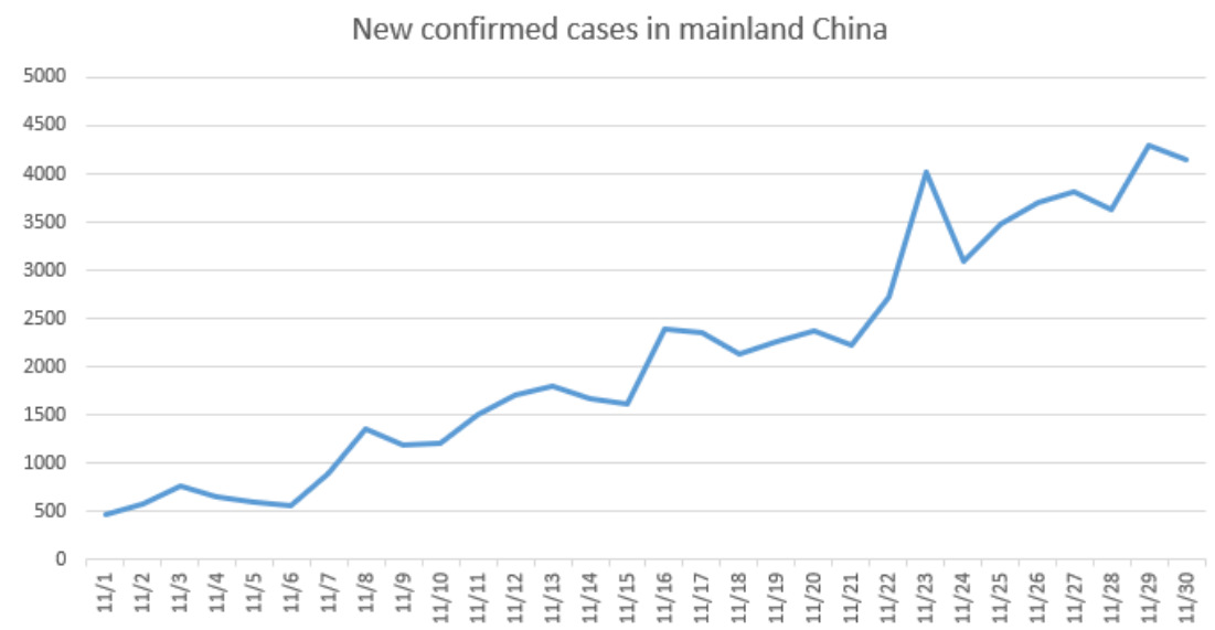
Figure 2: New confirmed cases in Chinese mainland