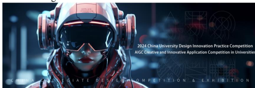
Figure 1: Milan Design Week AIGC Innovation and Creativity Competition