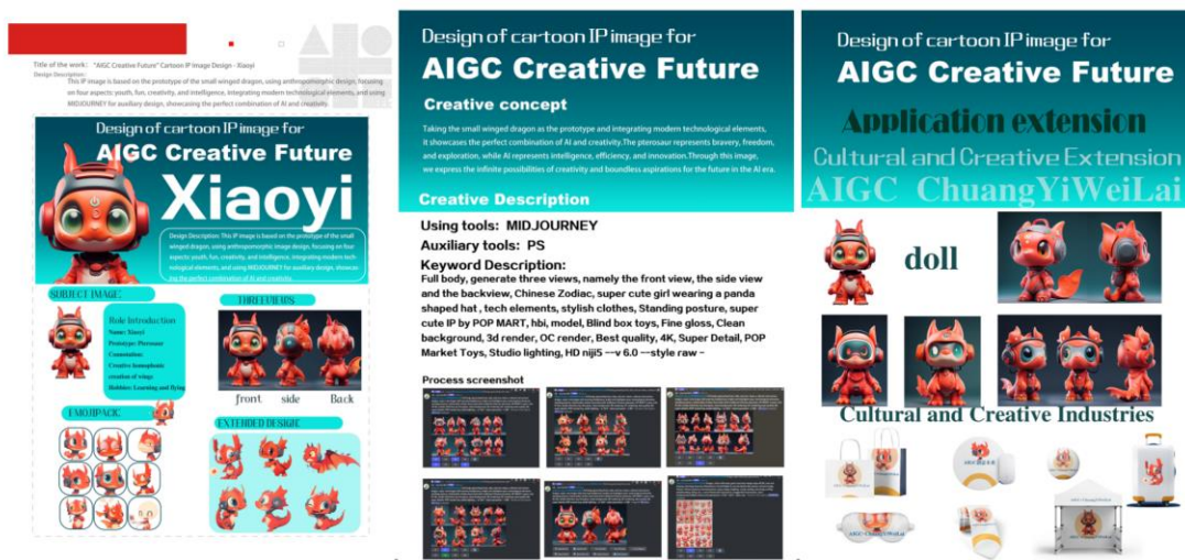
Figure 3: AIGC Practice Application Display - Cartoon IP Image Design Poster for "AIGC Creative Future"

Achievement Display and Exchange: The AIGC Innovation and Creativity Competition provides a platform for participants to showcase their achievements and exchange experiences. Through project presentations, academic discussions, and industry academia docking, it promotes communication and cooperation among participants, and promotes technological innovation and industrial development in the field of artificial intelligence. (As shown in screenshots of AIGC practical application process in Figure 3)[4]