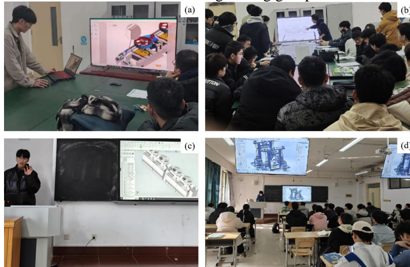
Figure 3: Snapshots from the teaching process: (a) The group collaborates with teachers to discuss design plans; (b) The group delivers a project summary to the entire class, with teachers posing questions and other groups providing evaluations; (c) and (d) Group members present updates on the design progress to the entire class during classroom sessions.

demonstrate each group's achievements. Additionally, after class, group units engaged in discussions with teachers to address any project design challenges encountered. Furthermore, upon completion of the course, group units participated in project design defenses for evaluation by peers. Displayed in Figure 3 are snapshots from the teaching process, highlighting that such activities not only enhance the presentation and communication skills of group members but also promote improved communication and mutual understanding among groups.