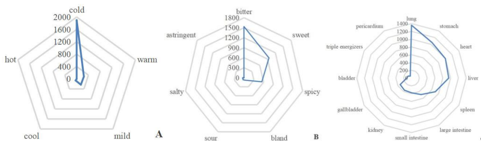
A: Flavors of herbs; B: Natures of herbs; C: Meridian tropism of herbs.

The 156 kinds of Chinese medicine's natures and flavors were mainly cold (1900 times), bitter (1532 times), sweet (954 times), and pungent (546 times), and the meridians were mainly the lung meridian (1359 times), stomach meridian (1053 times) and heart meridian (1001 times). See Figure 1.