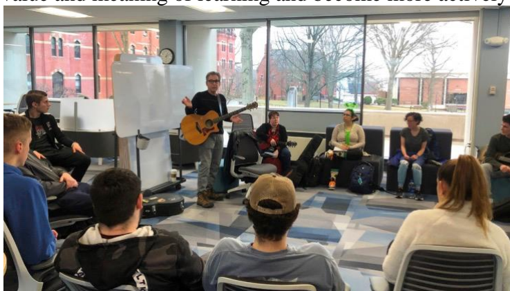
Figure 1: Explore the mysteries of music together

Cooperative learning also has a positive impact on students' interest and motivation in music learning. Cooperative learning can stimulate students' interest in learning. In group cooperation, students can explore the mystery of music and create music works together. This interesting way of learning can attract students' attention and stimulate their curiosity and desire to explore music (Figure 1) [9] . On the other hand, cooperative learning can enhance students' learning motivation. In group work, students can encourage and motivate each other. By achieving goals and achievements together, students can feel the value and meaning of learning and become more actively engaged in learning.