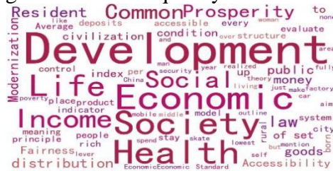
Figure 1: Chinese Modernization Common Prosperity Characteristics Word Cloud Map

In order to better understand the characteristics of common prosperity in Chinese modernization, we decided to conduct a textual analysis. Taking "Chinese-style modernization", "common prosperity" and other keywords as the theme, we reviewed relevant literature through Google scholar, Chinese government website, CCTV news, etc. After sorting and screening, we obtained 441 relevant articles. Then the text was cleaned, the text was segmented using 'jieba' in Python, and finally the word cloud was drawn according to the word frequency. As shown in Figure 1.