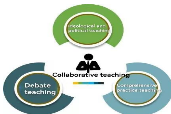
Figure 2: Three teaching modes