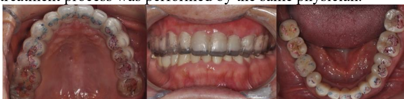
Figure 1: Intraoral and occlusal photos when wearing SS, the blue is the centric bite, and the red is the protrusive and lateral bite.

SS treatment: Silicone rubber impression was taken to make plaster cast. Occlusal recording silicone rubber was used to record the patient's centric position. Mounting articulator and adjust the parameters to make SS. The thickness of SS was about 2mm, and it was worn on the upper teeth. The time to wear SS was the whole day, follow-up visits to adjust and grind the abnormal points of occlusion, until the position of the condyle was in a stable. (Fig.1) SS was worn overnight after stabilization. The treatment process was performed by the same physician.