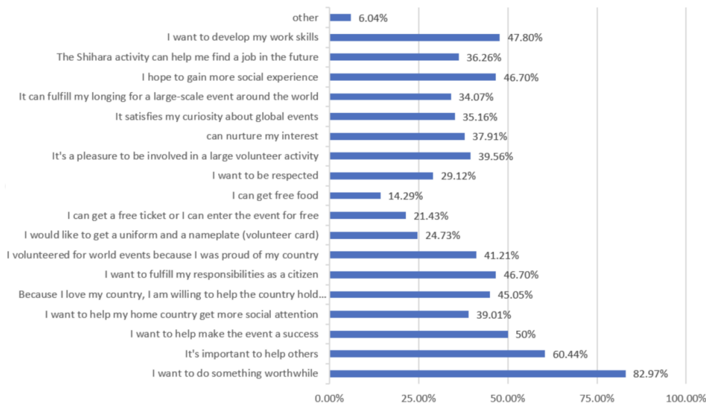
Figure 2: Data statistics based on the questionnaire on important intrinsic motivational factors - which intrinsic motivational factors are the main driving force for your participation in volunteer service

In the quantitative stage, adhering to a diverse and people-oriented perspective, a total of 186 volunteers (114 females and 72 males) completed the questionnaire survey after screening and removing unqualified data. The first page of the survey questionnaire clarifies the purpose of the study and the rights of participants. This questionnaire is anonymous and cannot identify individual participants through data analysis. To avoid the situation where there are no options, we have added some external factors to reduce the error, as shown in Figure 2.