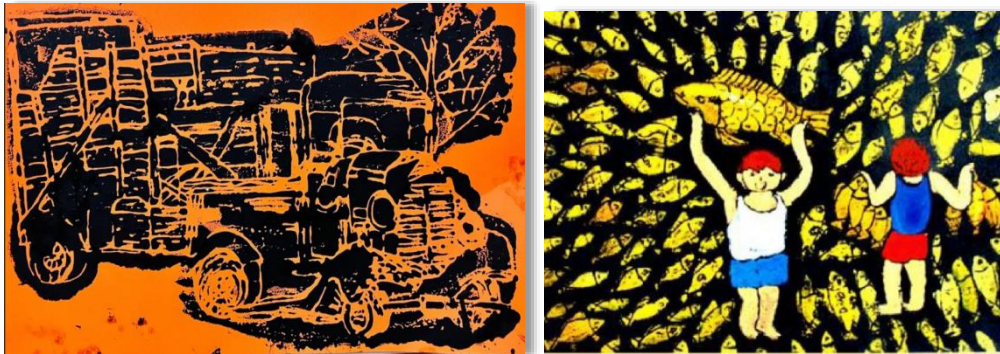
(a) Student's topographical work (b) Student's blow-moulding work

colour are in line with children's age, but also other forms of art can not be replaced, can improve children's hands-on ability and creativity. There are various types of prints such as woodcut prints, copperplate prints, paper prints, etc[7].For children, woodcut prints are more difficult, and the use of materials has safety risks. The soft texture of blow-molded paper printmaking paper makes it easy to use pencil to leave lines and other traces on the surface of the paper, and it can be easily coloured with gouache paints and easily reproduced on black cardboard, which can produce a variety of printmaking effects in a variety of forms and colours, which is very suitable for children to use (Figure 4).