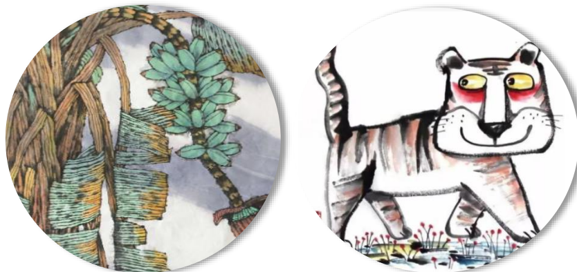
(a) Student's Ink Painting of Plants (b) Student's Ink Painting of Animals

Children's ink painting requires students to draw a complete composition of a realistic painting on fan-shaped raw rice paper, with any subject matter, which can be fruits and vegetables, flowers, animals, rocks and trees, and find their own speciality in painting (Figure 5). This form can cultivate students' love for and promotion of traditional Chinese culture, as well as improve the inquiry and aesthetic ability of preschool students.