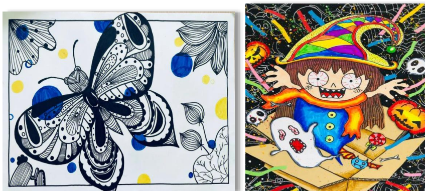
(a) Students' line drawing works (b) Students' colour pencil drawing works

As the art foundation of preschool students is generally weak, and they have not studied the structure and proportion of the human body, teachers should carefully guide students to apply the knowledge and techniques of simple and colourful pencil drawing to real life. For example, they can do line drawing of insects to let students experience the fun of creation, or do creative coloured brush painting, as shown in Figure 3, which can not only improve students' interest in learning, but also express their good wishes.