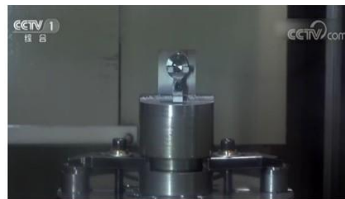
(d) Accelerometer Screenshot from the documentary "Great Nation Craftsmen"