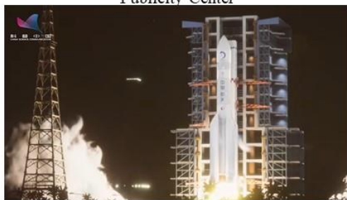
(c) Long March 5 rocket Screenshot from the promotional video of China Science communication