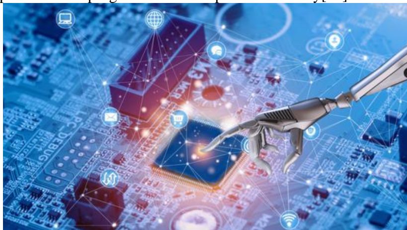
Figure 2: Concept map of the development of artificial intelligence in the financial field