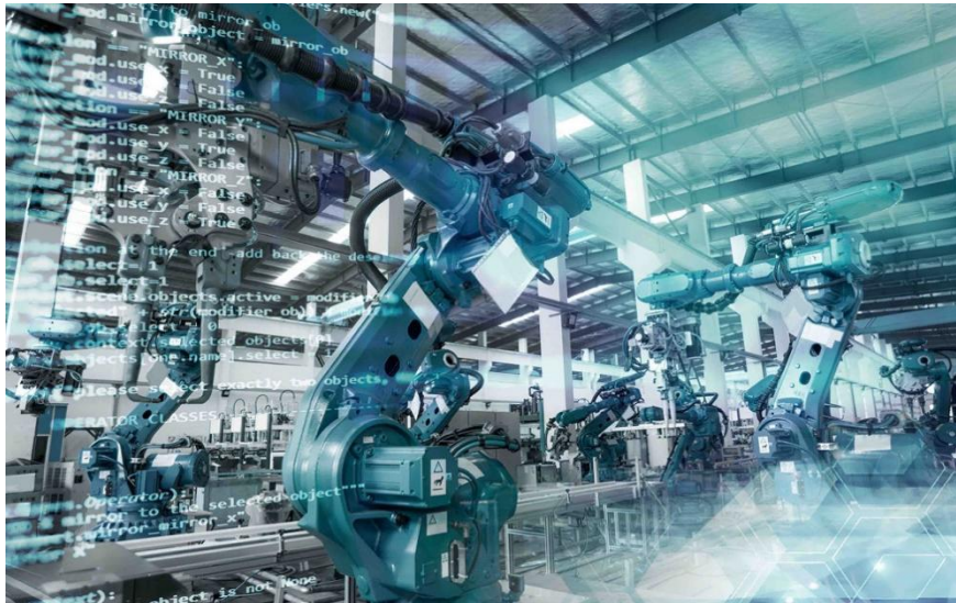
Figure 4: Development concept diagram of artificial intelligence in manufacturing field