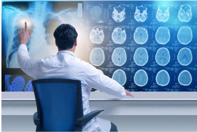
Figure 3: Concept map of the development of artificial intelligence in medical field