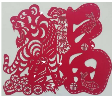
Figure 2: Paper Cuttings under AI

In our country's Paper Cuttings art design, this kind of unified, vivid, rhythmic and rhythmic aesthetic sense, dynamic and static, sparse and dense, diverse and unified, guests echo, virtual reality, vertical and horizontal, black and white contrast, overlapping and interlacing, and other traditional composition rules are common. The material language that expresses the emotions of Eastern culture through the processing and transformation of Chinese folk customs becomes a visual element of the charm of Eastern art that the audience can directly see. This kind of behavior carried out by artificial intelligence may not be called artistic creation, as it does not express its emotions through works and has no creative intention. But as viewers, we seem to have gained some additional interpretations and feelings from the work, as if this artificial intelligence program feels like a 'painter'. The speed at which computers learn painting styles is very fast. Perhaps it takes years for humans to master a certain style, while computers only need a few minutes to extract a certain painting style and proficiently assign any input content to this new style. Exquisite patterns made using laser cutting machines. Each work is exquisite and vivid. As shown in Figure 1, the cock in the Paper Cuttings pattern is holding his head high, which seems to be crowing in the sky, with a manly air.