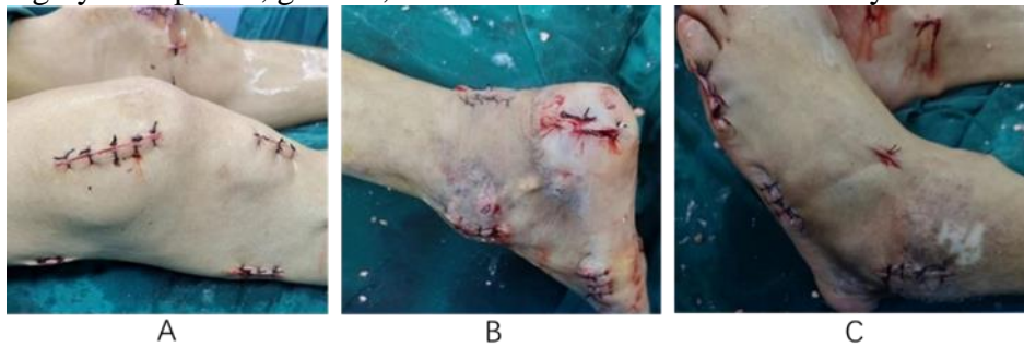
Figure 3: Gouty stone excision of both lower extremities. A-C: Wound closure of straight incisions, S-incisions, and Z-incisions for excision of gout stones in both lower extremities.

close the joint cavity. The autologous tissues were transplanted during the operation to repair and seal the standard hole and the synovial bursa to maximize the possibility of improving joint function after the procedure. Left hand, left wrist, left elbow, gout stone excision, etc. Under left brachial plexus anesthesia on March 27. The total amount of gout stones removed during the three operations was 985.6 g. The patient was discharged from the hospital on April 2 and continued to recuperate at home. The first stage of treatment was completed, with the wounds healed in stage I (Figure 4). Comparison of ADL before and after treatment: preoperative: 80 points, grade 1; one month after surgery: 100 points, grade 0; she could take care of herself daily.