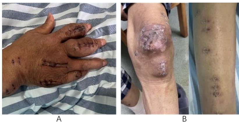
Figure 4: Wound healing in phase I. A: Wound healing after excision of gout stones in the left hand; B: Wound healing after excision of gout stones in the right knee and left arm.