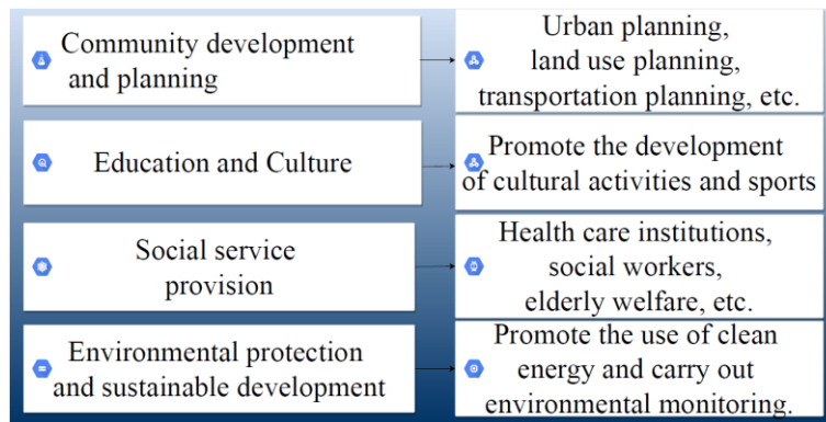
Figure 3: Social Governance Practice Content of Grassroots Governments

These social governance practices reflect the key role and responsibility of grassroots governments in social governance. The government needs to continuously improve and innovate social governance methods to adapt to the changes and needs of society. At the same time, grassroots governments also need to establish effective partnerships and work closely with social organizations, enterprises, and community residents to jointly achieve the goals of social governance.