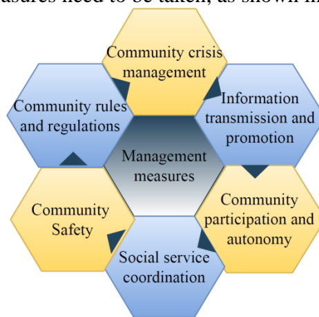
Figure 1: Management Measures

Community construction and management are one of the core responsibilities of grassroots governments in social governance, aimed at maintaining the orderly development of communities, improving the quality of life of community residents, and promoting community harmony and stability. Community construction refers to the comprehensive development and improvement of communities promoted by grassroots governments through planning, investment, and resource allocation[10]. Grassroots governments need to formulate urban and land use plans to ensure the rational development and utilization of land resources within the community. This includes the planning of residential areas, commercial areas, public facilities, green spaces, etc. to meet the different needs of the community. Communities need to have good infrastructure, such as roads, bridges, water supply systems, sewage treatment facilities, electricity supply, etc., to provide convenient living conditions. Grassroots governments should provide social service facilities such as education, healthcare, culture, sports, and social welfare to meet the needs of community residents. Community management is a key link in ensuring the orderly operation of the community, and a series of management measures need to be taken, as shown in Figure 1.