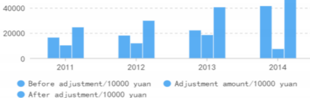
Figure 2: Comparison of accounts receivable balance