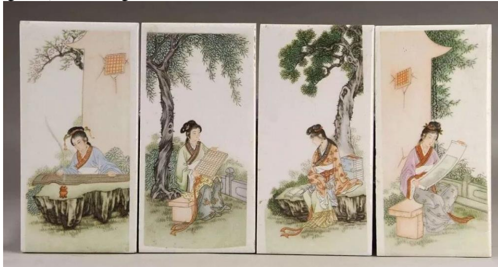
Figure 2: Nanchang porcelain painting

performing arts, oral legends, folk activities, folk traditional knowledge and practice, knowledge and practice related to nature and the universe, and traditional handicraft skills. Among them, the most representative intangible cultural heritage includes Nanchang porcelain painting (Figure 2), Yuzhang paper-cut (Figure 3), Nanchang dialect and so on.