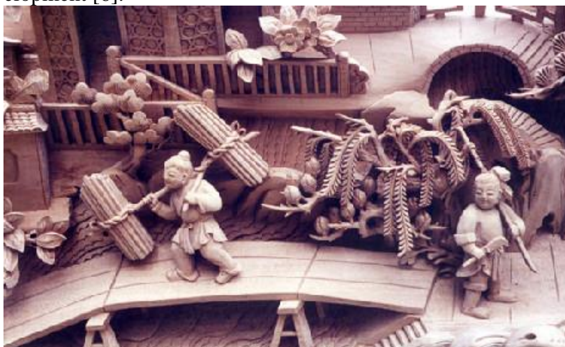
Figure 1: Intangible Cultural Heritage of Nanchang City

Promote sustainable development: Protecting and inheriting intangible cultural heritage helps to maintain ecological balance, promote social harmony and promote sustainable economic, social and environmental development [6].