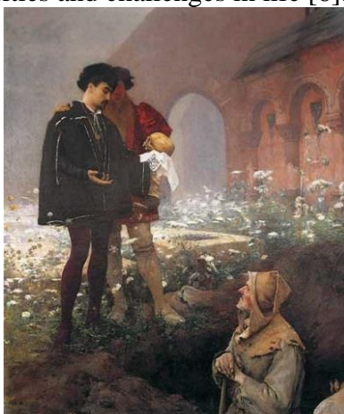
Figure 2: Hamlet

Literary classics often contain rich human wisdom and ideological connotation. Through in-depth reading of these works, college students can learn spiritual strength and enhance their life realm. For example, the image of Lin Daiyu in A Dream of Red Mansions can make college students deeply understand the complexity of human nature and the preciousness of emotion. The protagonist's revenge in Hamlet can make college students think about the values of courage, responsibility and justice, as shown in Figure 2. These spiritual forces can help college students to remain optimistic, firm and brave when facing difficulties and challenges in life [6].