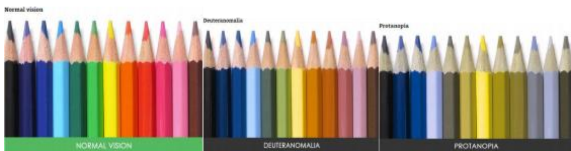
Figure 4: Comparison of normal vision and red-green weak vision

In other features of the application, such as chatting with friends and viewing a list of friends, the color of the title bar is set to gray, and the font color is set to black. After a user searches for a destination, the user interface displays the location of the destination and gives three options: Route, Start, Convoy. If the user clicks on "Route," the prototype shows the user options for "drive", "walk," and "bus." When a user clicks "Convoy," the page jumps to friend list, allowing the user to choose whom they will travel with. After that, the itinerary of users and their friends, as well as their location and estimated time to reach their destination, will be marked on the map interface. During the journey, users can click on their friends' avatars to view the navigation page from their friends' perspective. In the co-trip page, user can achieve the same function as clicking the "Start" button - enter the navigation page.