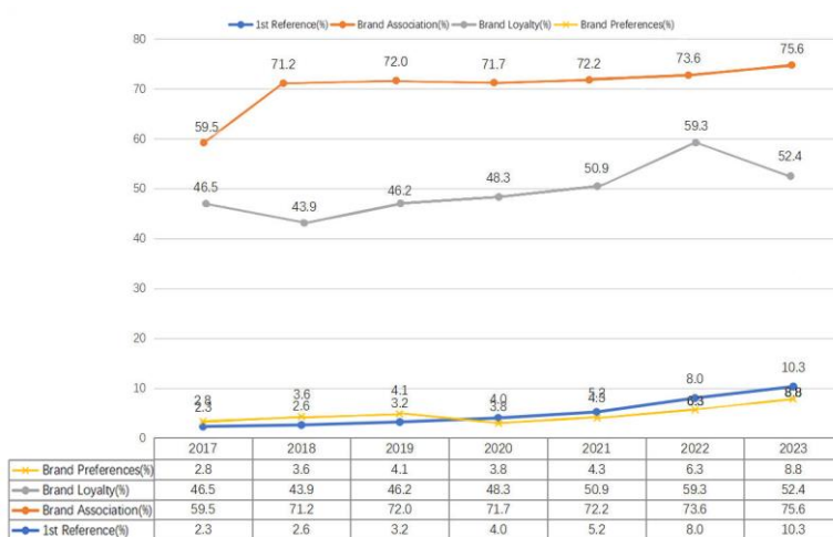
Figure 1: 2017-2023 ANTA C-BPI Ranking

Data source: Organized by the author based on data released by China Brand Power Index platform