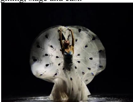
Figure 2: "Yunnan Image"

The better integration of ethnic culture and modernity is an important task for creators. In order to achieve this goal, it is necessary to cultivate more innovative talents, so that the works can be welcomed by the public through continuous "innovation" in the creative process. At present, the aesthetic vision of the younger generation has changed to a great extent compared with that of the post-80s and post-70s. Therefore, in the process of the integration of national dance and modern dance, the emotional expression of modern dance should be retained to meet the aesthetic pursuit of contemporary people, so that the integrated dance can be more contemporary. According to the current teaching needs, teaching situation and students' learning situation, we should comprehensively consider and arrange dance courses for students, and the teaching content should be adapted to the learning level of senior high school students. The cultivation of innovative talents can't be fixed in a certain mode or concentrated in a certain aspect, but should be spread out in all directions. As shown in Figure 2, the reason why Yang li Ping's "Yunnan Image" is a great success is that the creator not only deeply feels the original ecological characteristics of folk dances in Yunnan, but also innovates in lighting, stage and cast.