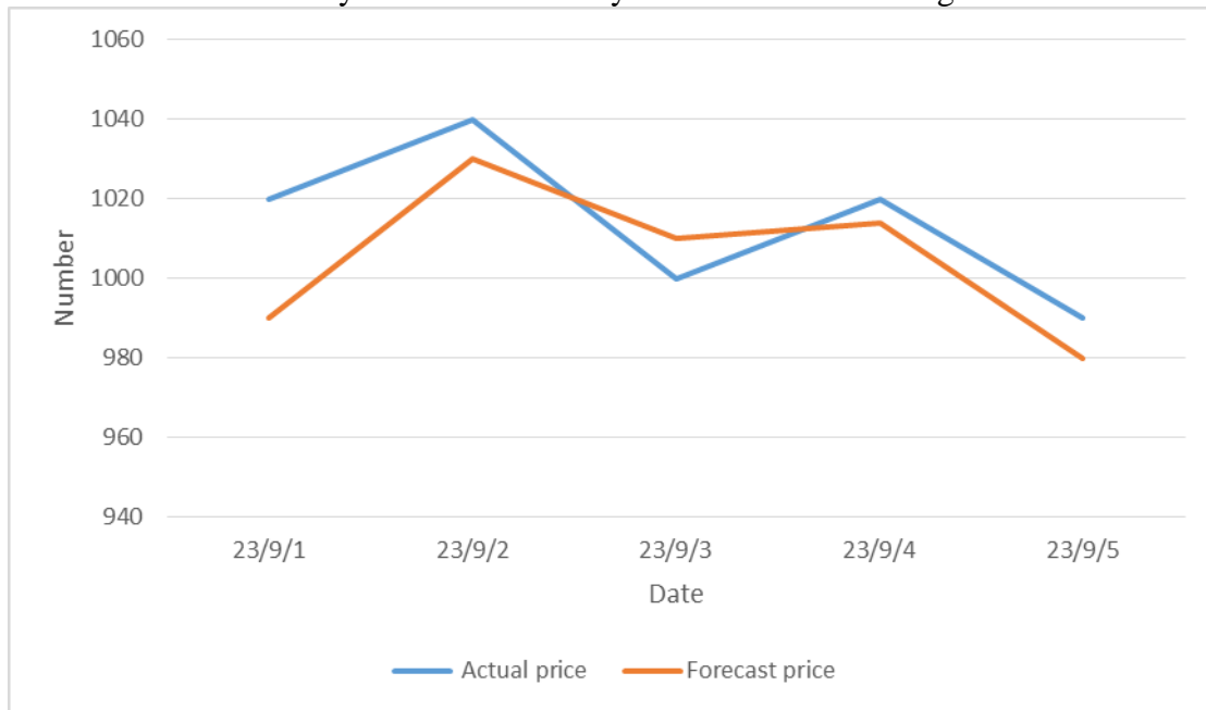
Figure 2: Trend analysis data

In order to better analyze the ruby-related data under the genetic algorithm, this article also conducted error and trend analysis. The trend analysis data is shown in Figure 2.