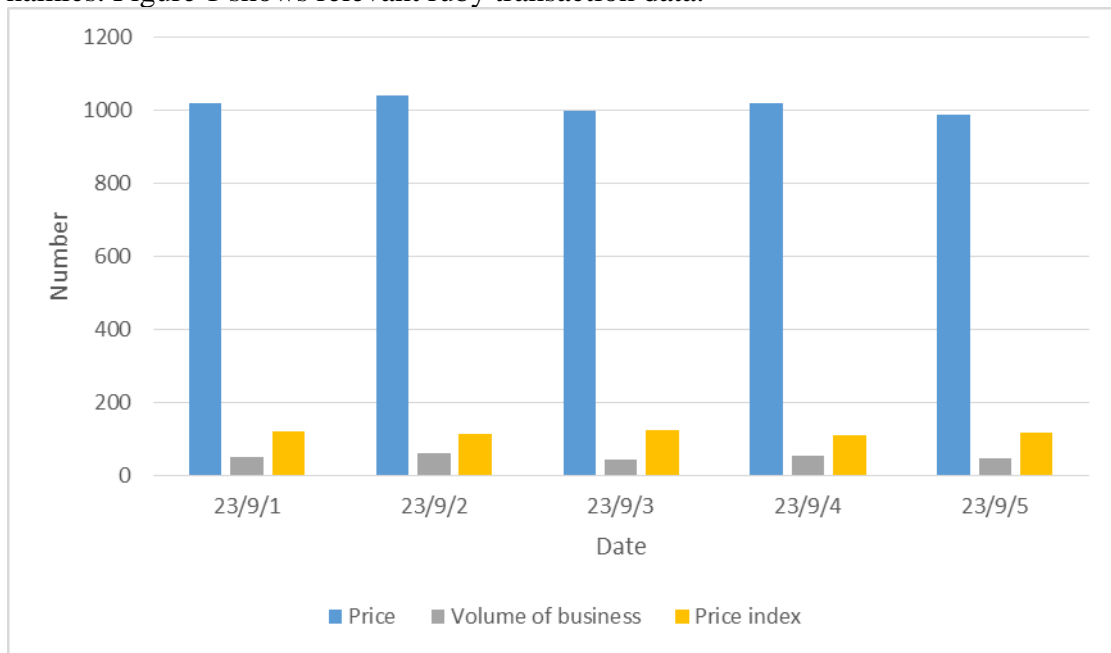
Figure 1: Ruby transaction data

In order to achieve dynamic analysis of ruby price changes, we adopted the following methods to collect data. First, we collected historical data on ruby prices through professional market research institutions, including price records over the past few years or decades. We also collect market data, such as supply and demand, trading volume and price indexes, to understand overall market trends and dynamics. Figure 1 shows relevant ruby transaction data.