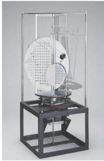
Figure 1: Light Prop for an Electric Stage (Light-Space Modulator)

In the early 1930s, the Bauhaus theatre staged a different kind of ballet, "Mechanical Dance", in which the dancers, dressed in geometric costumes, moved as if they were geometrical bodies, moving and transforming, and in the centre of the stage, accompanied by changing light and shadow, which enriched the unique sense of art in this performance. This structuralist performance is a bold crossover that also explores the relationship between geometry, movement and time, and the interaction between geometric movement and light and shadow. The exploration of light, shadow and mechanical movement in the early days of kinetic sculpture (early twentieth century) can be seen as highly creative and ahead of its time, but it was not until Julia Roberts's 1996 film Mary Reilly that the beginning of true "virtual kinetic sculpture" was ushered in, fuelled by the use of technology.