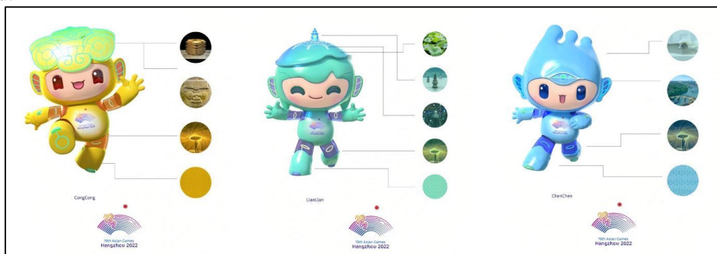
Figure 1: 2022 Hangzhou Asian Games logo and mascot design

The integration of a large amount of local traditional culture in the design helps to bring Hangzhou's and Oriental culture to the international stage, promoting the inheritance and publicity of our culture. The distinctive regional characteristics enhance the audience's viewing experience during the Asian Games. Through the use of traditional elements, the Asian Games will become a blend of traditional culture and modern sports, presenting a captivating and culturally rich event to the world.