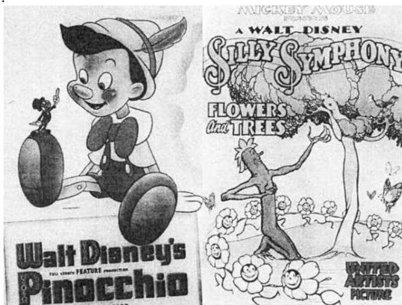
Figure 5: Pinocchio, Flowers and Trees

The most famous watercolor illustration work in the United States is Disney, which unites the immigrant culture from all over the world, closely combines watercolor illustration with the animation industry, and opened many famous animation companies, making the commercial value of illustration works reach the peak. Many of Disney's early works were created on the basis of watercolor painting. In 1932, it created the world's first full-color cartoon animation, Flower and Tree, in 1937, the first animated film, Snow White and the Seven Dwarfs, and in 1942, the second animated feature film, "Pinocchio"..... Its original shape is presented in watercolor painting technology. Later, with the improvement of ability and the development of technology, hand-drawn cartoons became the pride of Disney. For example, The Lion King became a popular work, which opened up a new situation for the application of watercolor painting in the art of illustration, just as shown in Figure 5.