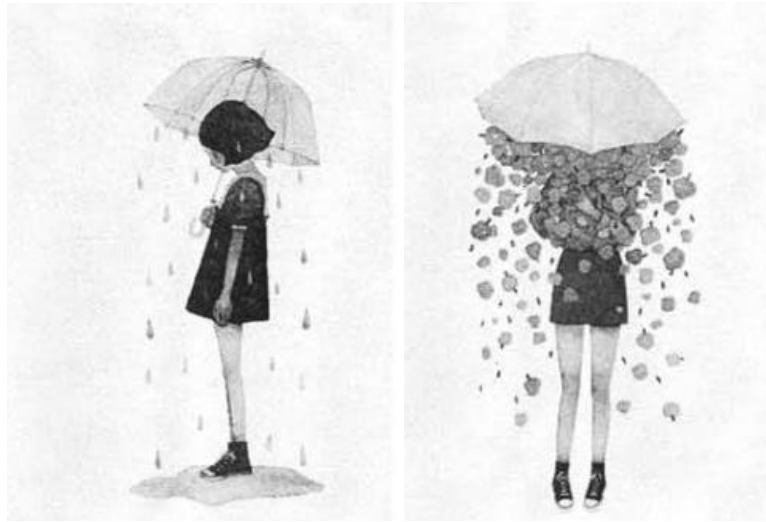
Figure 7: Lee Misook Watercolor illustration works