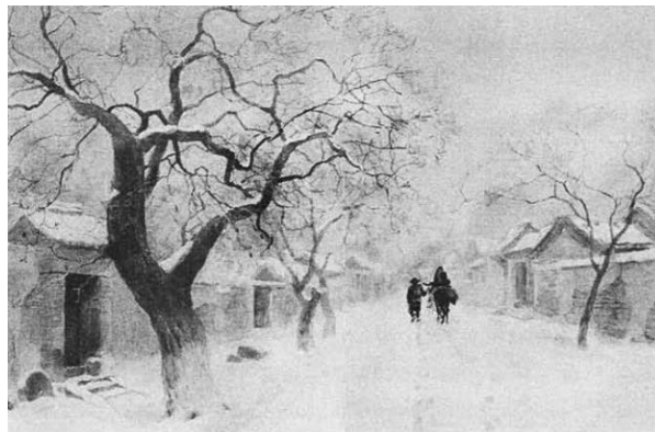
Figure 3: The illustration of "The South of the City"

effective coordination between illustrations and text and present the ideal effect [4] , just as shown in Figure 3.