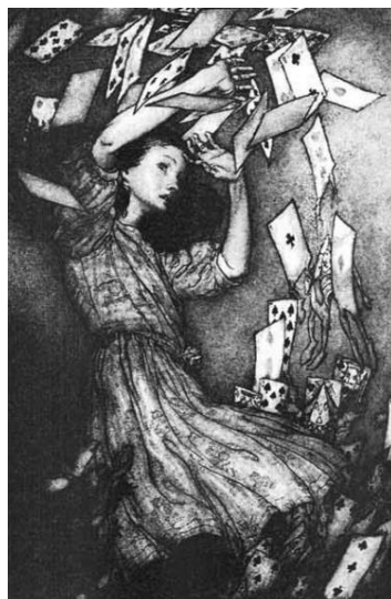
Figure 4: Alice Sleepwalking Mirror

Europe is the birthplace of western civilization, and its cultural inheritance and development are at the forefront in the world. As an important part of the cultural system, art presents different characteristics and trends in each stage of historical development. The reason why the watercolor illustration of Europe and the United States is not only because it is a habitual name, but also