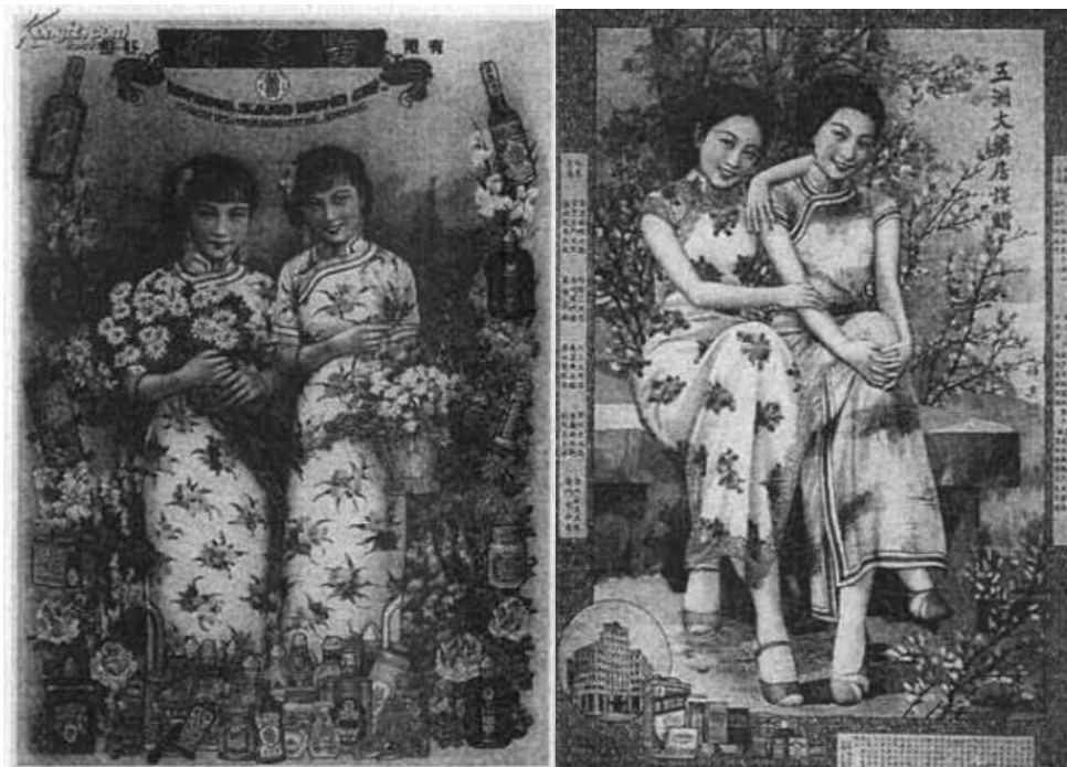
Figure 2: Hang a aying "month brand" works

The contemporary watercolor painter Guan Weixing is also one of the representative figures, creating important value for the application and development of watercolor painting in the art of flower arrangement. The illustration in Lin Haiyin's "Old Stories of the City" is written by Guan Weixing, which adds a lot of luster to the book and makes the plot and characters more deeply rooted in the people. Guan Weixing's watercolor illustrations pay more attention to humanistic feelings, technical skills and artistic attainments, which bring out the best with the words and were widely praised by the social crowd at that time. Mr.Guan Weixing carefully designed and rigorously studied every vessel, object, costumes and architecture in the South of the City, so as to ensure the