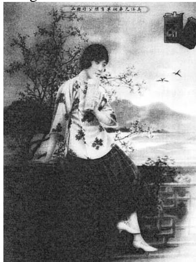
Figure 1: Zheng Mantuo's "Month card" works

create watercolor illustrations, and in 1920, set up "One Studio", the earliest modern advertising agency in China, with representative works such as "Beautiful brand cigarettes" and "Double Sisters Brand Toilet Water" [3], as shown in Figures 1 and 2.