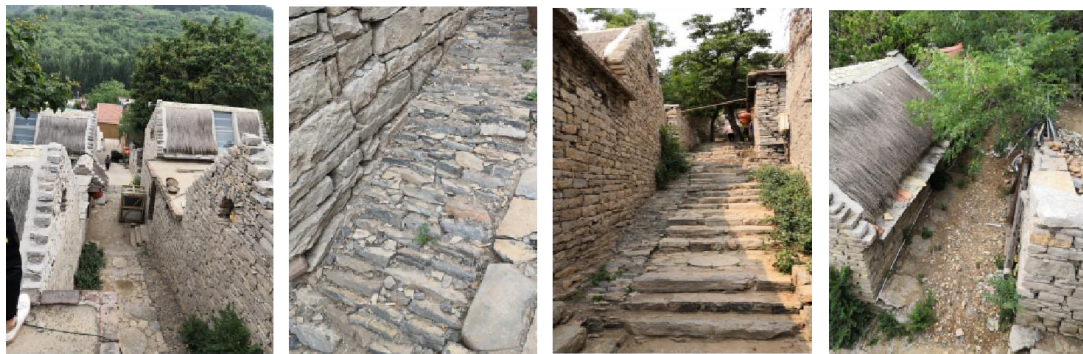
(a) (b) (c) (d)