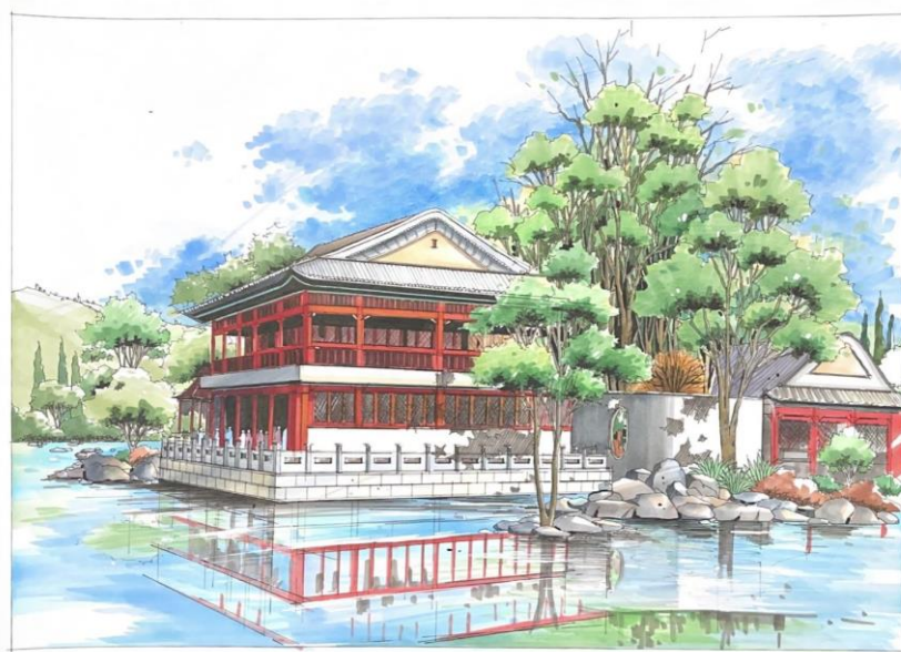
Figure 2: Qing dynasty garden, Author's hand drawing

Replication and inheritance are important issues in our time. In today's Beijing, the architecture of residential gardens is a copy of the architecture of the landscape, so how to inherit the essence of the design of the Qing dynasty style landscape design, meet the multi-level needs of people, and have a positive meaning for the cultural life of the residential people. The northern garden mimicry the south of the river, which has been shown in the middle of the Ming Dynasty. In the northern suburbs of haidian town, royal gardens, lakes, springs, bureaucrats and noble relatives are all buying the garden here, and many of them are making a sense of the style of the garden of the river. This trend naturally affects royal gardens (As shown in Figure 2).