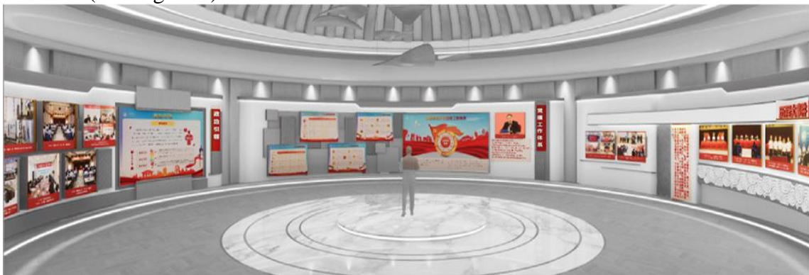
Figure 1: Effect Picture of the Inner Mongolia Autonomous Region Discipline Inspection Commission's Online Digital 3d Clean Governance Education Exhibition Hall

In 2020, the author collaborated with a company to complete the construction of the Inner Mongolia Autonomous Region Discipline Inspection Commission's online digital 3D clean governance education exhibition hall. The project mainly applied 3D exhibition hall design technology, 3D modeling technology, 3D development technology, server-side development technology, HTML5 development, etc., to build an online digital party building exhibition platform. In the project, users can interact with the exhibition hall through scene roaming, 3D object interaction, video viewing, and audio commentary while in the digital exhibition hall on a mobile platform[4]. In terms of roaming settings, users can choose to automatically roam or manually roam and interact with the exhibition panels, integrated media, databases, and video players in the digital exhibition hall (See Figure 1).