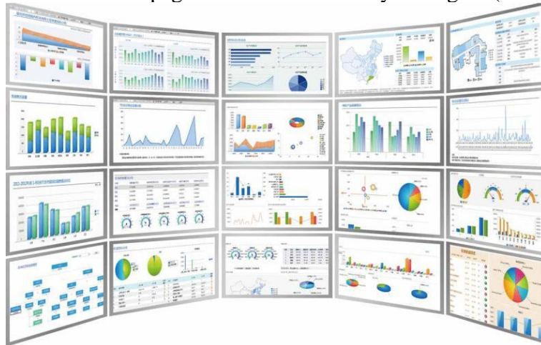
Figure 3: Integrated Interface Design

In addition, the user interface of the digital exhibition hall adopts a responsive layout design. The overall style of the interface is simple, and UI elements such as buttons, text boxes, and windows are designed with color blocks. This method can maximize the reduction of network bandwidth pressure, and the browsing method of data is mainly chart-based. The design of the data editing terminal and the management terminal is more practical and concise. Java is used as the main development language for the proposed development language and database system backend. The database uses MYSQL, and the front-end uses JS to develop related data functions and interface interactions, while the front-end 3D page is based on the Unity3D engine (See Figure 3).