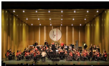
Figure 2: Presentation of national music culture in university evening performances

By learning all kinds of national musical instruments, students can actively participate in learning, actively learn relevant national culture and connotation expression, improve students' learning efficiency, follow the guidance of teachers, get in touch with more musical instruments with different national styles, broaden students' musical horizons, and cultivate their national vocal