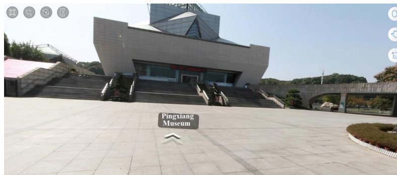
Figure 3: The AR View of Pingxiang Museum.