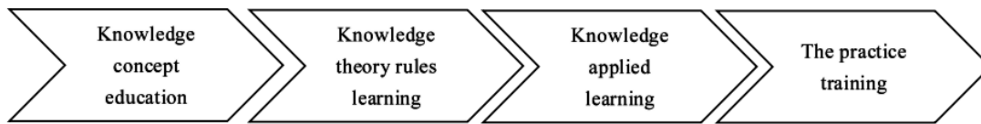
Figure 2: Internal knowledge education of knowledge unit