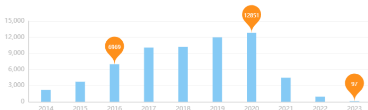
Data source: China Beida Law Treasure-Judicial Case Database

From the perspective of judicial practice, according to the search of the judicial docket search system of Beihang University, there were 67,017 cases from January 1, 2014, to May 24, 2023, under the title of "Illegal Absorption of Public Deposits." [2]The following chart has 1 set of related data analyses.