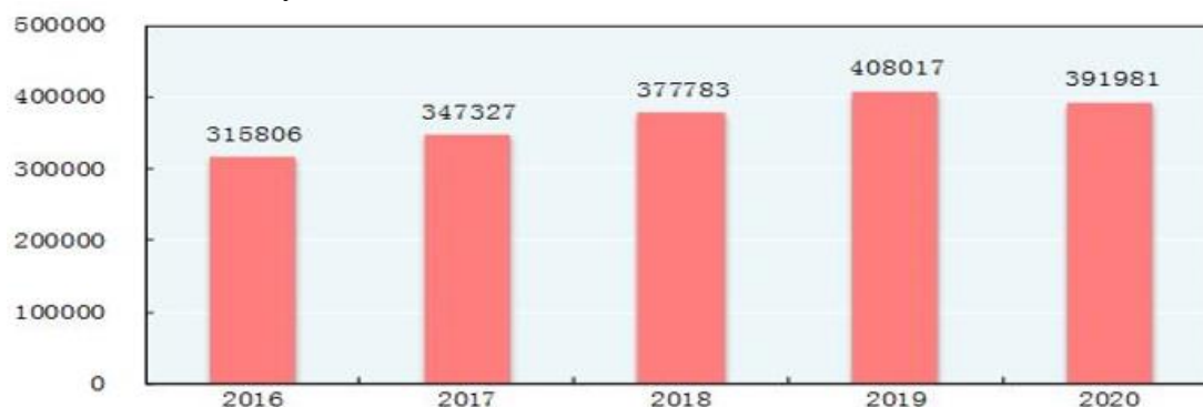
Figure 1: Total retail sales of consumer goods in 2016-2020

As shown in Figure 1, according to relevant statistics, in 2020, the retail sales of grain, oil and food increased by 9.9%, beverages by 14.0%, tobacco and wine by 5.4%, cosmetics by 9.5%, daily necessities by 7.5%, Chinese and western medicines by 7.8%, cultural and office supplies by 5.8%, communication equipment by 12.9%, clothing, shoes, hats, needles and textiles by 6.6%, gold, silver and jewelry by 4.7%, household electrical appliances and audio-visual equipment by 3.8%, furniture by 7.0%, construction and decoration materials by 2.8%, petroleum and products by 14.5%. Automobiles fell by 1.8%.