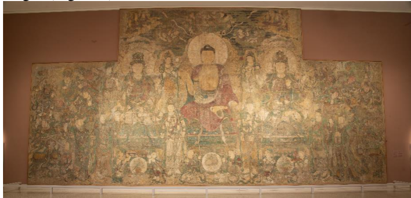
Figure 5: Medicine Buddha Sutra Change on the east wall of the Grand Hall

Guangsheng Temple, the temple was built in the first year (147) of Emperor Huan of the Eastern Han Dynasty, and was rebuilt in the autumn of the ninth year of Dade (1305). The two murals in the Grand Hall of the lower temple of Guangsheng Temple date from the same Yuan Dynasty, the east wall is named "Medicine Buddha Sutra Change" (Figure 5), and the west wall is named "Prajvalosnisah Change" (Figure 6).