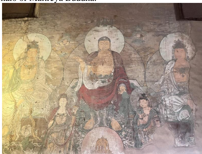
Figure 4: Maitreya's Buddhahood Sutra Change on the east wall of the Grand Hall

The Qinglong Temple in Jishan County, Shanxi Province, was built in 662, and the two frescoes in the Grand Hall of temple are both Yuan Dynasty frescoes, the east wall is called The picture of Sakyamuni preaching and the west wall is called "Maitreya's Buddhahood Sutra Change " (Figure 4). The west wall central Maitreya Buddha was sitting in a posture with legs hanging down, wearing a red semi-cloak type robe, feet under the two lotus platform. The Kalavinka is placed in a pair on either side of the head halo of Maitreya Buddha.