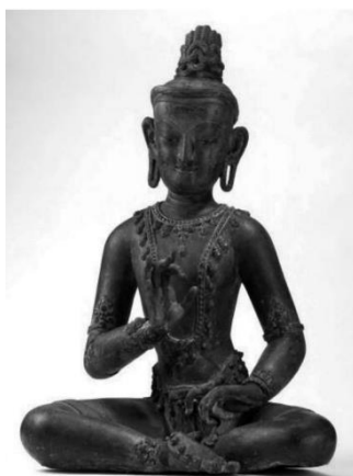
Figure 3: Manjushri Bodhisattva statue, 1305 Collection of the National Palace Museum, Beijing