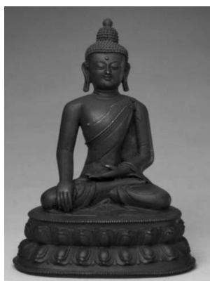
Figure 2: Shakyamuni statue, 1265 Collection of the National Palace Museum, Beijing