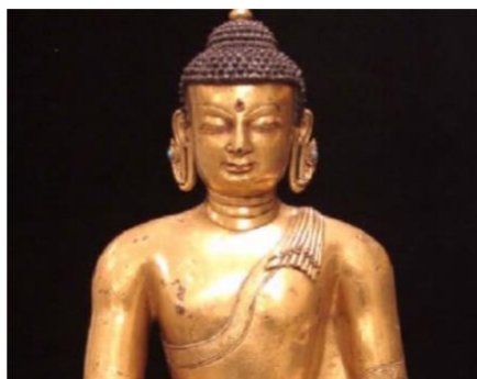
Figure 1: Shakyamuni Partial 13th century Nepal, Rubin Museum Collection, USA

The facial image of the Buddha became secularized with the artisan's skill, and the intermarriage of Nepalese with surrounding ethnic groups gave the nation a multi-ethnic appearance. The image of the Buddha in the Mara period (Figure 1) combines the features of various ethnic groups in Nepal, including the broad, flat face of the Mongolian race and the high nose and thin lips of the Europa and Aryan races. This makes the Buddha's face soft and refined, and makes him a beautiful man who can represent the characteristics of Nepal. "By the late Mara period this facial feature was continuously enhanced, with slender eyebrows connected to the line of the nose in an inverted herringbone, a nose as wide as the corners of the lips, and a slightly upturned mouth with a smiling expression, which is a typical Nepalese feature of the Buddha's face." [2] In addition to the facial features, the artistic characteristics of Nepalese statues are also a major feature of their body posture. The transition from the chest to the waist of the Buddha is clearly exaggerated, which is unique to Nepalese statues and is fundamentally different from the pre-Indian Gandhara and Mathura statues. The Nepalese statue has reduced the waist profile and focused more on the thick limbs. The depiction of the clothing pattern still follows the art style of Mathura, showing a flat treatment of the clothing pattern.