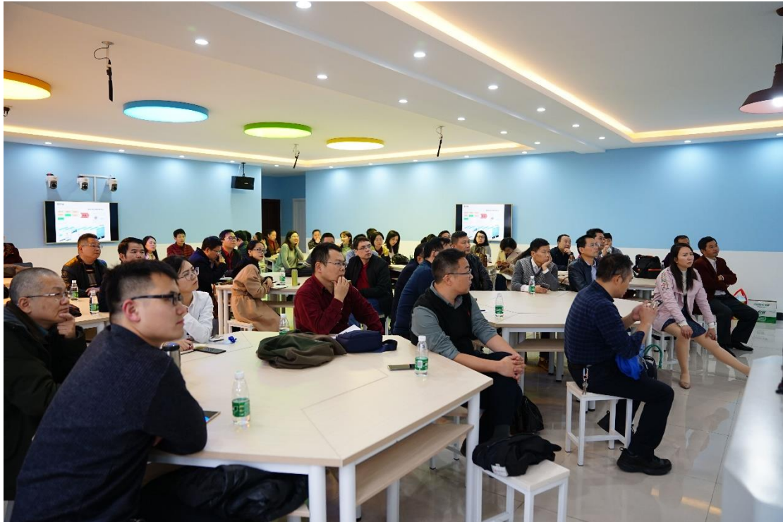
Figure 2: Professional skills role of vocational English teachers