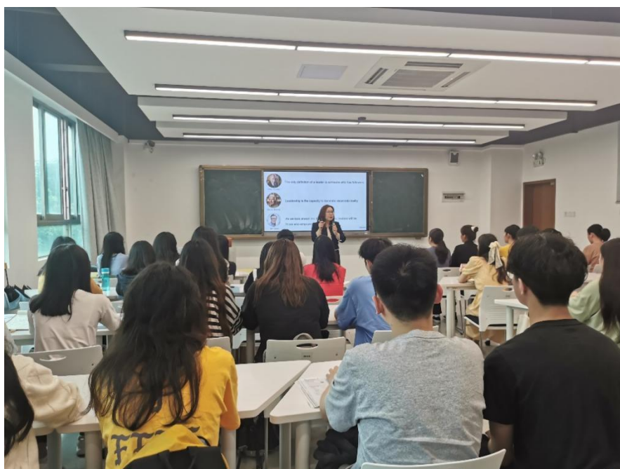
Figure 4: The role of management leader for vocational English teachers

Higher vocational English teachers are not only educators, but also leaders and managers. They need to have good organizational and management skills, be able to plan and organize teaching activities, formulate teaching plans and objectives, and effectively monitor and manage students' learning (Figure 4).