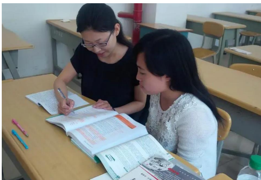
Figure 1: The role of vocational English teachers as educators

As educators, teachers should not only impart knowledge, but also guide and enlighten students. English teachers in higher vocational colleges should focus on cultivating students' comprehensive qualities and abilities, guiding students to have correct values and ethics, and helping students form a correct outlook on life and the world [6]. This requires vocational English teachers to have knowledge of educational theory and psychology, be able to reasonably design and implement teaching activities, actively guide students to participate in various educational activities, and thereby help students develop comprehensively (Figure 1).