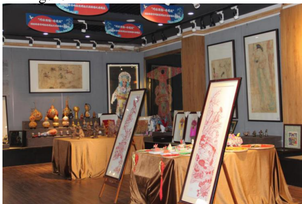
Figure 2: Exhibition of intangible cultural heritage

(3) Schools can offer some community service courses to let students practice and inherit intangible cultural heritage in the community. This can not only improve students' knowledge and understanding of intangible cultural heritage, but also promote the interaction and cooperation between schools and communities, and jointly promote the inheritance of intangible cultural heritage [14-15], as shown in Figure 2.