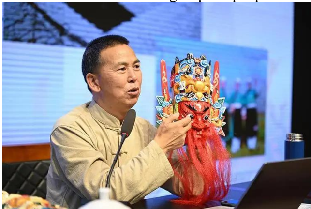
Figure 4: The inheritor gives an explanation.

In order to give students and the public more choices and participation space, the school can also classify and grade the inheritance projects. In this way, students and the public can choose their own interesting inheritance projects more pertinently, and improve the social benefits and influence of inheritance work. For example, we can divide heritage projects into different themes and levels, such as "traditional music", "traditional dance" and "traditional handicrafts", and set corresponding courses and activities to meet the needs of different groups of people.