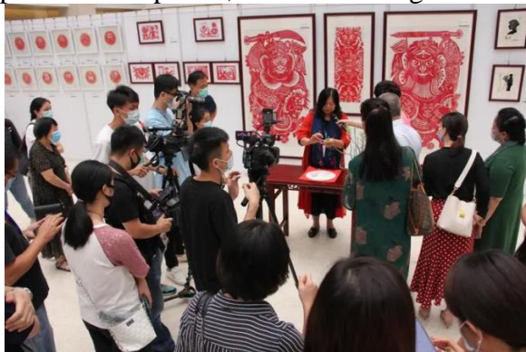
Figure 1: Students experience paper-cut culture

form of cultural experience activities and improve students' interest and love for intangible cultural heritage. For example, visit the location of intangible cultural heritage projects, such as traditional craft workshops and opera performance places, as shown in Figure 1.