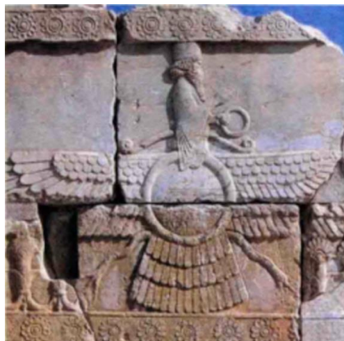
Figure 1: Solar Disk, (Photo credit: Li Ling, Li Ling's Collection of Archaeological Art History, Ever-Changing [M], Beijing: Life ·Reading New Knowledge Sanlian Bookstore, 2016.10).

Langer clearly points out that "art symbols" aren't equal to "symbols in art". When discussing their differences, she believed that symbols in art have semantic meanings that linguists fully recognize. Their role is to construct art pieces (or expressive forms). That is to say, "art symbols" is constructed by "symbols in art". As shown in Figure 1, Solar Disk as an art symbol in ancient Egypt. Initially, the Solar Disk had only wings. Since the Fifth Dynasty of Egypt, a new symbol, the circular disk, was placed between the wings. Later, during the end of the Old Kingdom, sacred snakes were added to the left and right of the circular disk. In this art symbol, the wings, circular disk, and sacred snakes are symbols used in artistic creation and have well-defined meanings in the ancient Egyptian cultural context. The conveyed meanings still exceed the symbols' limits, for instance, the wings symbolize the wings of the falcon-headed god, Horus, a symbol of divinity that provides protection. The circular disk symbolizes the sun, while the sacred snake symbolizes Wadjet, the protector god and defender of the pharaoh of Egypt. From Langer's perspective, the "art symbol" constructed from these "symbols" with defined meanings is a construction method or design method.