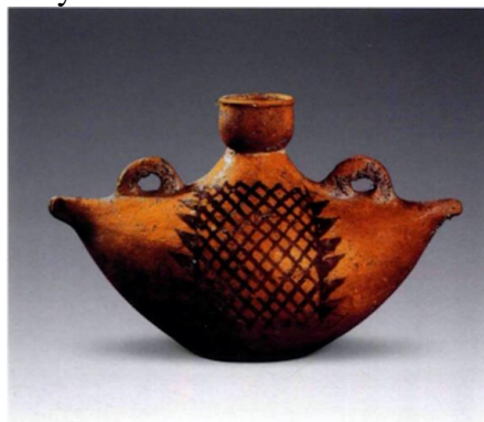
Figure 3: Boat-shaped painted pottery pot, (Photo credit: Chinese Ceramics Series I Neolithic Age [M], Shanghai: Shanghai People’s Fine Arts Publishing House, 2019.3).