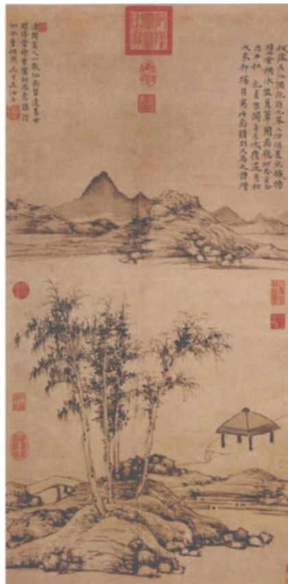
Figure 4: Ni Zan, Maple dropping on the Wu river, (Photo credit: Ni Zan [M], Shijiazhuang: Hebei Education Press, 2006.9).

Langer believes that perception of artistic significance is a kind of intuition. When we appreciate a work of art, “those intuitions that are constantly involved in understanding and form the basis of discursive activity will immediately become artistic intuition.” [11] If artwork is a unique symbol, just as Langer acknowledges that any artwork is an individual and special presentation of what it