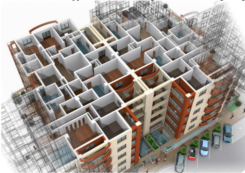
Fig.1 3D Building Information Model

processing (as shown in Figure 1). From this model, staff can master various aspects of the actual project construction process. For construction personnel and subcontractors in various disciplines, BIM technology can enhance their communication and exchange, providing favorable conditions for the efficient and orderly construction of construction projects. Building design units, construction units, and owners can also achieve closer communication and contact through the information model platform. Especially in the architectural design stage, the information model platform built by BIM technology can better promote good interaction between each department involved in the design, strengthen communication and communication between departments, and conduct good coordination on existing and emerging issues, thereby making it more professional. Accurate data and information are applied to various designs such as drawing design[7].