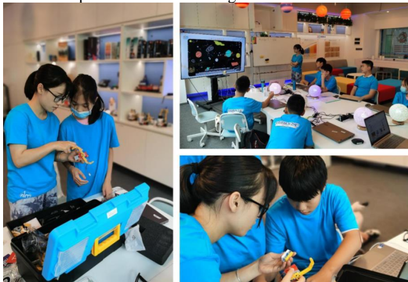
Fig.2 Process Diagram of Labor Education Practice

in the stage of productive labor in detail, and cultivate students' skills in using simple production tools. In the AI era, university labor education should not only explain the necessary labor knowledge and skills, but also pay attention to spreading educational contents such as labor spirit and labor value to students, so that students can adapt to the ever-changing objective world. At the same time, in order to promote the growth of university students' labor education in the intelligent age, it is an essential and primary step to create a good social environment and family atmosphere. Therefore, we should lay a good environmental foundation for cultivating new people with new historical characteristics in the intelligent era and establish a scientific mechanism of labor education institutions; So that students can participate in productive labor on the spot and guide them to create in housework, explore in field production and innovate in public service. Through labor practice, students can personally understand the difficulties of laborers, and then firmly establish the thoughts and feelings of respecting labor and loving labor, and change the bad thoughts of relaxing and hating work and getting rich overnight. The stage of applying AI technology to labor education practice is shown in Figure 2.