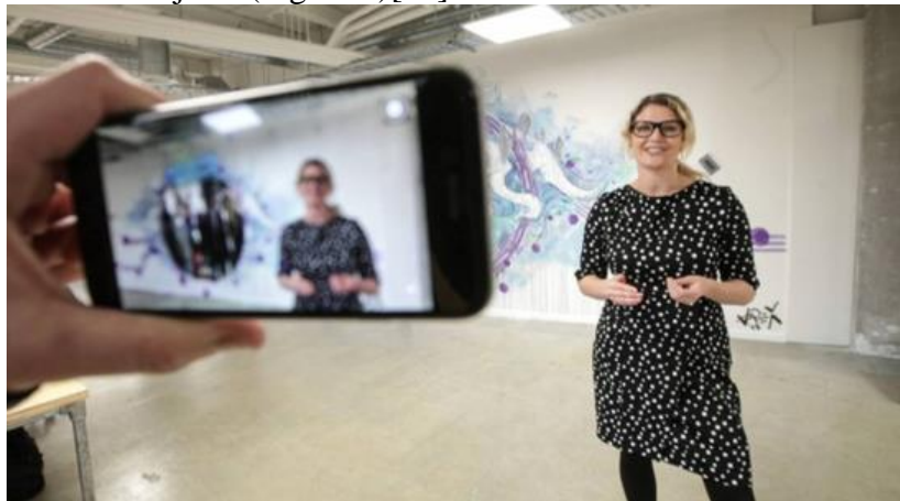
Figure 4: Virtual technology improves patients' communication depression in medical treatment.

In the overall effectiveness of patients' rehabilitation training, the situation of rehabilitation training is conducive to the mixed service of ability and function, which makes the rehabilitation training of breast cancer patients improve continuously, limits the space and environmental factors, improves the overall training plan, makes patients easily feel overall burnout, and makes patients' rehabilitation training begin to decrease. Diversified virtual environment can promote the reshaping of nerves and strengthen the overall movement and learning. In order to continuously improve the training environment for patients, so that patients can carry out autonomous training, some researchers have divided breast cancer surgery into four stages, and according to them, they have introduced and designed corresponding MR and AR technologies, so that patients can complete the overall training and rehabilitation and the continuous selection of physical condition by watching 3D rehabilitation exercises, and the overall collection of somatosensory facilities can improve the standard data and exercise data of patients and carry out intervention after three months. Uploading the standard data of rehabilitation training and physical condition, in the process of virtual reality exercise, the overall exercise intensity is increased, and it is constantly adjusted according to the patient's tolerance [18].