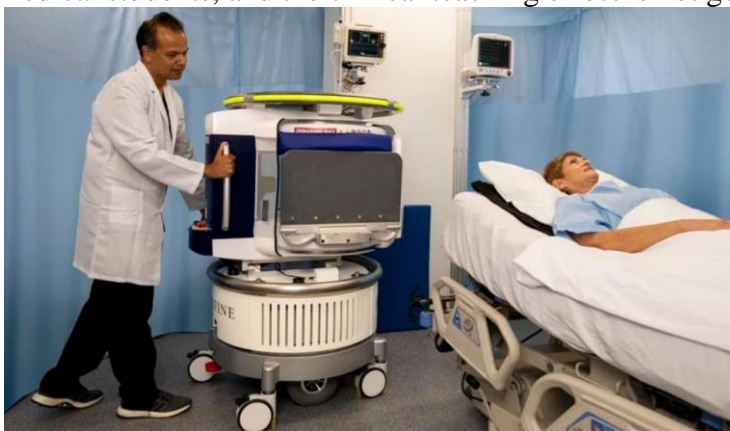
Figure 5: The first MR scanner in the world

The overall form lacks certain interest, which specifically reduces the learning initiative of medical officials, which enables it to improve the overall clinical teaching results, especially for improving traditional teaching methods, which can greatly improve the learning and reduce the learning initiative of medical students, and the clinical teaching effect is not good (Figure 5).