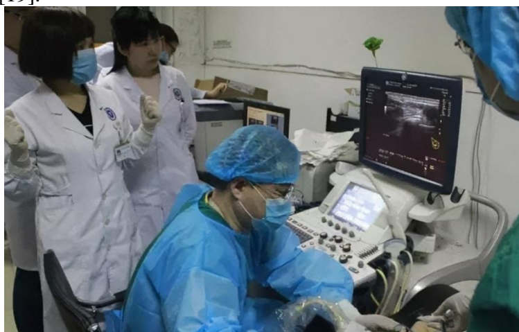
Figure 6: Clinical observation of breast cancer

Doctors need to master the anatomy around the lesion to avoid the occurrence of overall complications, but for young doctors, the overall reduction experience is insufficient and the overall success rate is low, so it is necessary to strengthen the simulation training on the platform on weekdays to meet the overall technology of MR and AR, and professional training to meet this skill is needed (Figure 6)[19].