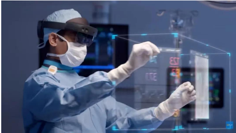
Figure 2: Schematic diagram of Mr Technology