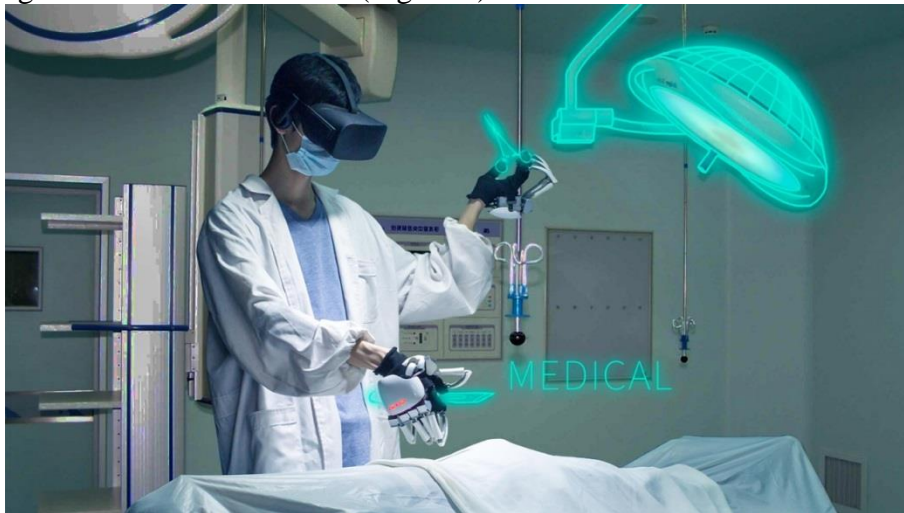
Figure 7: Schematic diagram of the application of virtual reality technology in clinic

related mechanism research. In the operation process of Zhengji, the cultivation of surgical ability and whether the operation can be successfully completed are determined by many factors. At the same time, when doctors train their planning ability again, the direct way to solve the problem and improve the safety and effectiveness of the whole operation. Similarly, by simulating virtual surgery technology for patients, the technology can be completed, and various technologies can be continuously improved to realize the research and development of the ability training platform and improve the surgical standards of trainees (Figure 7).