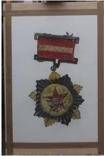
Figure 3: Li Xueli's work "Relics of Revolutionary Martyrs: Medal"

In the teaching of basic sketch courses in colleges and universities, the common difficulties faced are the overflow of fragmented information in the current era, and the lack of students' endurance, observation ability and continuous logical thinking ability, resulting in the lack of students' ability to deeply depict pictures, and the low degree of completion of works. In response to this problem, long-term homework training and meticulous basic sketch training can enable students to observe the performance object for a long time and complete a relatively high degree of completion of full-open sketch works. Due to the large size of the full-open works, the details of the objects are enlarged, and the students are also required to paint with a rigorous and serious attitude. To draw a natural object with a sense of volume on the plane, we need not only to grasp its shape, that is, the external outline of the object, but also to draw the "sense of volume" of the object, that is, width, height and thickness. That is, "Engel once said, 'There is a contour line in the shape.'" [4] Therefore, through the long-term training of large-scale homework, the students' perseverance, endurance and rigorous attitude to study have been trained.