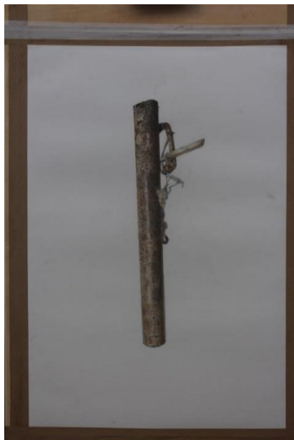
Figure 2 Qiu Fang's work "The Self-made Gun Barrel of the Red Army"