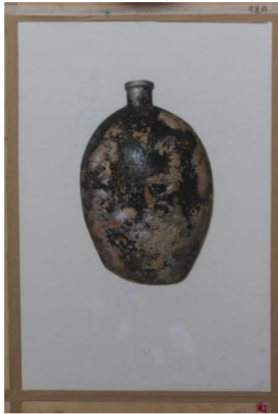
Figure 1: Old Aluminum Pot by Zhou Lianting

For example, Zhou Lianting's work "Old Aluminum Pot" (Figure 1), Qiu Fang's work "Self-made Gun Barrel of the Red Army" (Figure 2), and Li Xueli's work "Relics of Revolutionary Martyrs: Medal" (Figure 3) are all classroom assignments completed in this course based on the pictures collected in the museum. The students polished their "craft" in the long-term basic sketch training. "In a society with physical labor as the core," craft "laid the foundation of" craft "." [3]