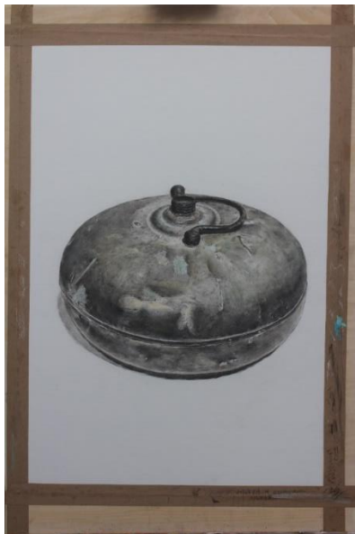
Figure 5: The Hand Warming Pot by Zhang Xueming