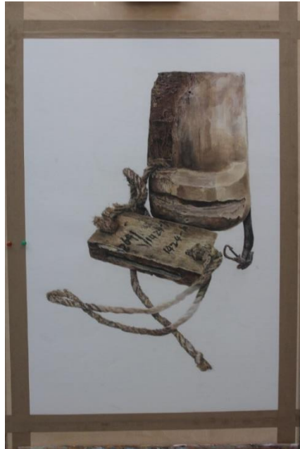
Figure 6: The Wood Used by the Red Army by Li Tingting