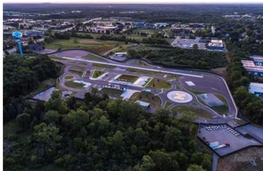
Figure 2: GoMentum Station proving ground