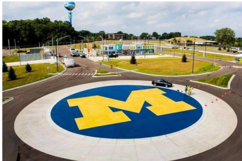
Figure 1: Mcity proving ground

Europe, the United States, Japan and other industrialized countries attach great importance to the testing and evaluation of smart cars and transportation. The United States has established test sites in many places. Such as Mcity proving ground, as shown in figure 1; GoMentumStation proving ground, as shown in Figure 2, etc. The European Union has also formulated a smart car development link, trying to regard intelligent networked cars as one of the most important development directions in the process of industrialization, and has built a number of test facilities and venues, such as AstaZero; WillowRun and so on. Applusidida, a Spanish company, and HoribaMira, a British company, also designed the intelligent networked vehicles in a targeted way, and redesigned the traditional vehicle test site to meet the test requirements of the intelligent networked vehicles. As shown in Table 1 [1].