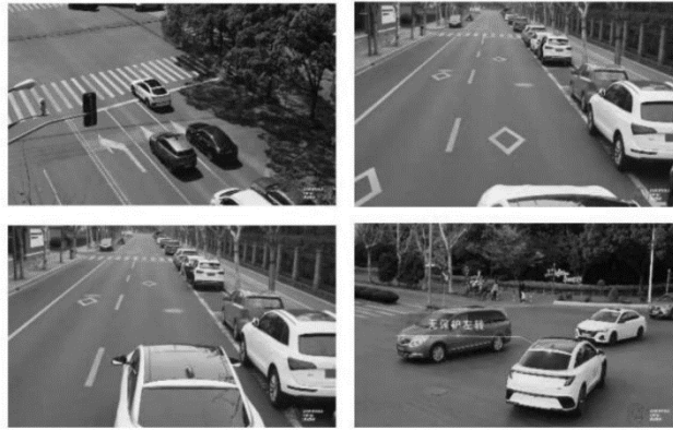
Figure 5: Classification of Design Scenes

The scene of the intelligent networked automobile test site is a comprehensive reflection of the environment and driving behavior in a certain time and space. The scene layout is the construction of the automobile test environment, which is a deepening design based on the planning plane. Different scenes can be laid out along the road alignment, and various typical characteristic test environments can be built. In the scene design, each scene should be tested, and the test route loop of the test item and the route interference between multiple test items should be fully considered, so that the automobile test can not only meet the requirements of standards and regulations, but also maximize the test capacity of the test site [9]. The test scenario is a driving condition composed of weather conditions, road traffic facilities, traffic participants and other external conditions, as well as the driving tasks and status of the vehicle. Car companies need to change the development mode and test method to scenario-based development mode and test method, and drive the development iteration with the scenario, and conduct efficient test based on the scenario, as shown in Figure 5. Considering various factors, we can define and construct the scene library of automatic driving function in the design, as shown in Table 4.