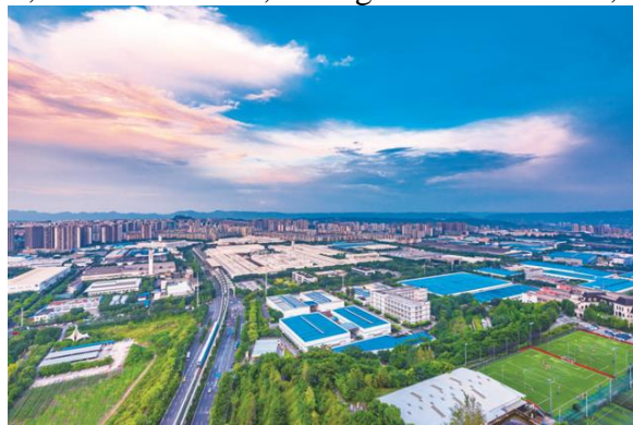
Figure 3: Chongqing Intelligent Networked Automobile Testing Center

At present, many parts of the country have stepped up efforts to build intelligent test areas for networked vehicles and actively promote the testing and inspection of semi-closed and open roads. For example, the closed test area of Shanghai Demonstration Zone is located in the south of Shanghai F1 Stadium. The total length of the road is 3.6 kilometers. A mobile simulation building is installed at the intersection to simulate the urban environment, a parking lot and a small gas station. Intelligent traffic lights and intelligent communication equipment are installed on the roadside, and a temporary simulation information protection tunnel is built. Chongqing Demonstration Zone has built a leading international demonstration project and public utility product development platform for smart cars and transportation applications. This plot covers more than 90% of the special road conditions in the western region and more than 85% of the road and communication environment in China, and supports research, test verification, testing and certification, as shown in Figure 3.