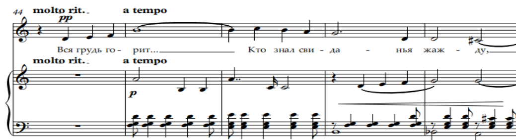
Figure 4: The accompaniment music reflects the theme motivation

In the 42 section of A' segment, the accompaniment part reproduces the music theme motivation of the previous A segment, making the music continue to develop to the end, which is still unsatisfactory. (Figure 4)