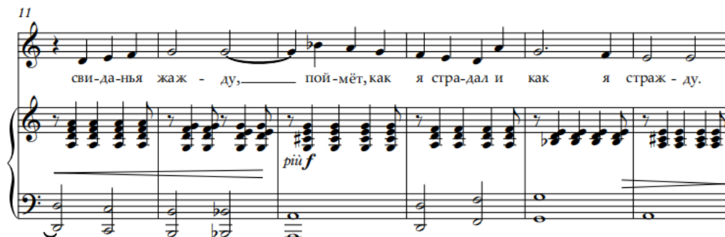
Figure 2: Detuned chords were used for the tuning of the strings

In terms of harmony, a large number of detuning chords are used for tuning. For example, in section 12, the second-order seven chords in D harmony major, that is, the second-order seven chords of falling five tones, are used. In section 26, the second-order seven chords of A-harmonic major are used, and in section 28, the second-order seven chords of G-harmonic major are used. These chords are resolved to the functional chords of the respective tones. The beginning of the five passages is the harmony function of the owner of each different tone, and this technique is used to clarify the tonality of each passage. (Figure 2)