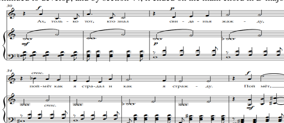
Figure 3: The lyrics are repeated to express the emotion

There are appropriate changes in the application of lyrics in creation. Its biggest feature is to use lyrics repetition to express emotions. This technique fully reflects Tchaikovsky's creative concept of expressing emotion with music melody as the leading factor in his creation. Lyrics should serve the expression of music and represent people's rich emotions [5] . It can be seen from the spectrum that the melody development of the first two sentences of A and A' is almost the same. In addition to the different lyrics in Section 30-31, the application of lyrics is repeated elsewhere. After that, the B segment continued to develop, and by section 44, it ended on the main chord in D major. (Figure 3)