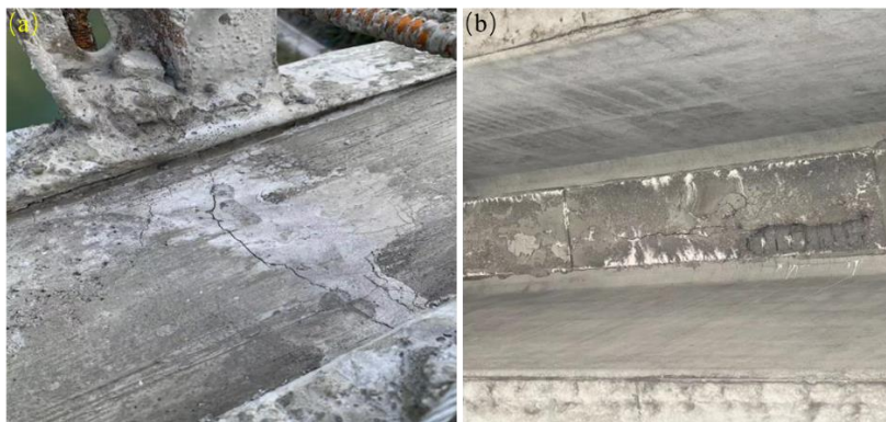
Figure 3: Cracks caused by settlement. (a) cracks in bridge members; (b) Cracks appearing in the drainage tank.

The main man-made cause of land subsidence is the excessive exploitation of groundwater[4]. Land subsidence is not the only harm caused by overexploitation of groundwater. Although water is the source of life, this practice is no doubt harmful. If you want water, you have to find another way. The overexploitation of underground water has occurred in the China from time to time, resulting in a total land subsidence of more than 60,000 km 2 . A large area of ground settlement appears in the city, and cracks and deformation occur in the components of roads and bridges. Some underground pipeline equipment appeared short circuit, broken lines, and other faults; water drains in the city were also damaged. The collapse of the ground makes the fertility of the originally fertile farmland begin to decline and even causes farmers to waste farmland; in this situation, the residents' buildings appear to crack or even collapse in a straight line, and the flood control capacity is greatly reduced, so that the standard reference points of various monitoring begin to deviate, which is a huge impact on the construction of various sectors of the national economy, causing the loss of human, material and financial resources, and even endangering people's life safety. The damage of land subsidence to the city is shown in Figure 3.