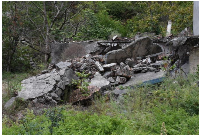
Figure 1: Land subsidence caused serious house collapse.

All kinds of problems caused by land subsidence cannot be underestimated. It not only causes great economic losses but also threatens people's life safety. The main cause of land subsidence in these cities is still man-made. If human beings go on like this, it is like lifting a stone to drop on their own feet, self-destruction. To develop, human beings need not only to obtain nature but also to live in harmony with nature with the attitude of scientific development. Land subsidence is dangerous, but what is more dangerous is not knowing how to protect and cherish the earth. Urban land subsidence is shown in the figure 1: