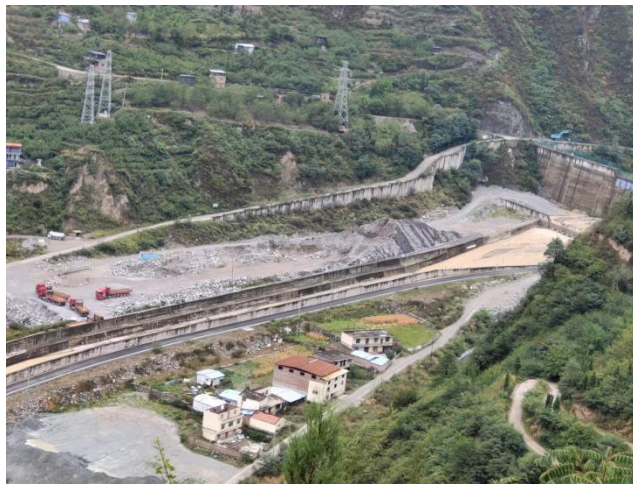
Figure 2: Land subsidence threatens residential safety.

Mainly due to changes in the natural environment caused by the settlement are these several: first, due to the action of gravity, the surface of the original loose or relatively loose strata in the loose layer will be compacted downward, become dense and hard than the original change, then the thickness of the stratum will change, that is, the ground settlement. Second, under the action of the geological structure, the ground sag and subsidence[3]. Third, the earthquake caused the ground settlement. An earthquake is a stress anomaly below the ground. To bring the stress back to a state of equilibrium, the stress will be released, and the ground may collapse. As a result of these processes, human civilization will be damaged to varying degrees, such as through cracks and depressions in buildings. When the land sinks below sea level, the seawater may flow back into the depression, causing flooding is shown in the figure 2.